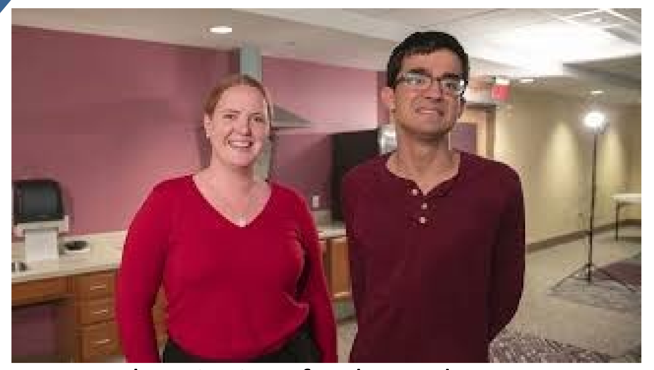
The Dignity of Independence